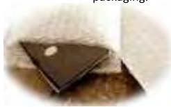
HEAVY DUTY BUBBLE POUCH Made of our best Heavy Duty 1/2" bubble wrap, this is customizable to ensure the ultimate protection of package contents! It is perfect for protecting smaller sensitive materials such as electronics, furniture during storage and shipping, fragile products such as industrial machinery.