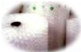
HEAVY DUTY BUBBLE (3/16" & 1/2") The strongest bubble wrap available on the market; 3X stronger than regular bubble wrap.

We supply value added bubble wrap at 3/4", 1/2" & 3/16" (slit, perf'd, adhesive and cohesive)