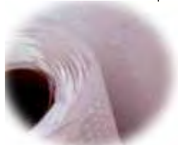
CLOTH BACKED BUBBLE Ideal for wrapping sensitive items. The perfect solution for easily scratched items. Used in applications such as: furniture and automotive packaging.