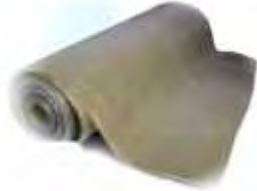
PABBLE-PAPER BACKED BUBBLE A laminate of bubble and paper ideal for wrapping furniture when moving. Self adhesive or cohesive rolls are available to reduce excess packaging.