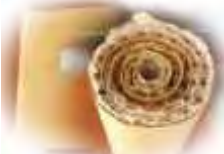
CORRUGATED BUBBLE WRAP This bubble wrap product is backed by corrugated cardboard resulting in a very strong packaging solution and does not require a box or protective cushioning. Very cost effective, simple to use and durable.