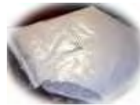
PILLOWPAK The Pillowpak is a composition of 2 or more layers of bubble wrap encased in a plastic bag. Pillowpaks are perfect for items of irregular shapes and different sizes. The result is a super protective packaging solution that is simple to use.