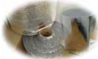
METALIZED BUBBLE Adds thermal protection while cushioning the items and are also available in pouches as well. It is very effective for insulated projects.